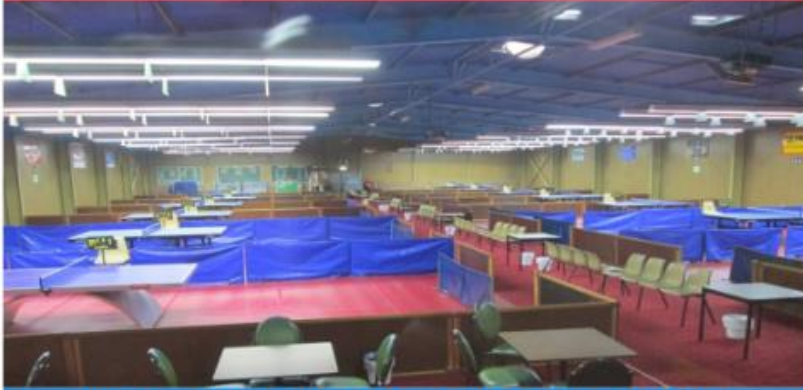
TABLE TENNIS A GAME FOR GENERATIONS

AS PART OF ACTIVE APRIL BALLARAT TABLE TENNIS STADIUM IS OPENING ITS DOORS SUNDAY 23 APRIL 11am – 4pm 427 Dowling Street Wendouree Kellie 0430829701 AI 0418394726